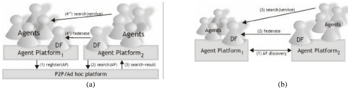
Figure 2: (a) Architecture using AP discovery, (b) Architecture using FIPA-defined AP discovery

between DF description [15] and the native service description of the underlying platform is needed. As in the first model, this mapping is needed for each underlying platform supported by FIPA. Other DFs can search DFs by using the search functionality provided by the underlying platform and then federate. This model is almost